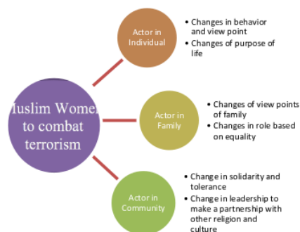
Figure 2. Model of combatting terrorism through the role of Muslim women

level. This strengthening can involve women to help in combatting terrorism. Retno, Indonesian Foreign Minister, when she attended the Ninth Ministerial Plenary of the Global Counter-Terrorism Forum (GCTF), said that women have a big role in instilling positive values in the family (TribunNews.com, 2018). Muslim women can also play an active role in preventing the occurrence of terrorism, such as providing education to their children about the dangers and effects of acts of terrorism so as to shape the character of children who can distinguish between positive actions and radical actions.